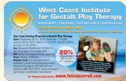
Sample half page ad

Rates * If not submitting placement-ready, please add Design Fee.